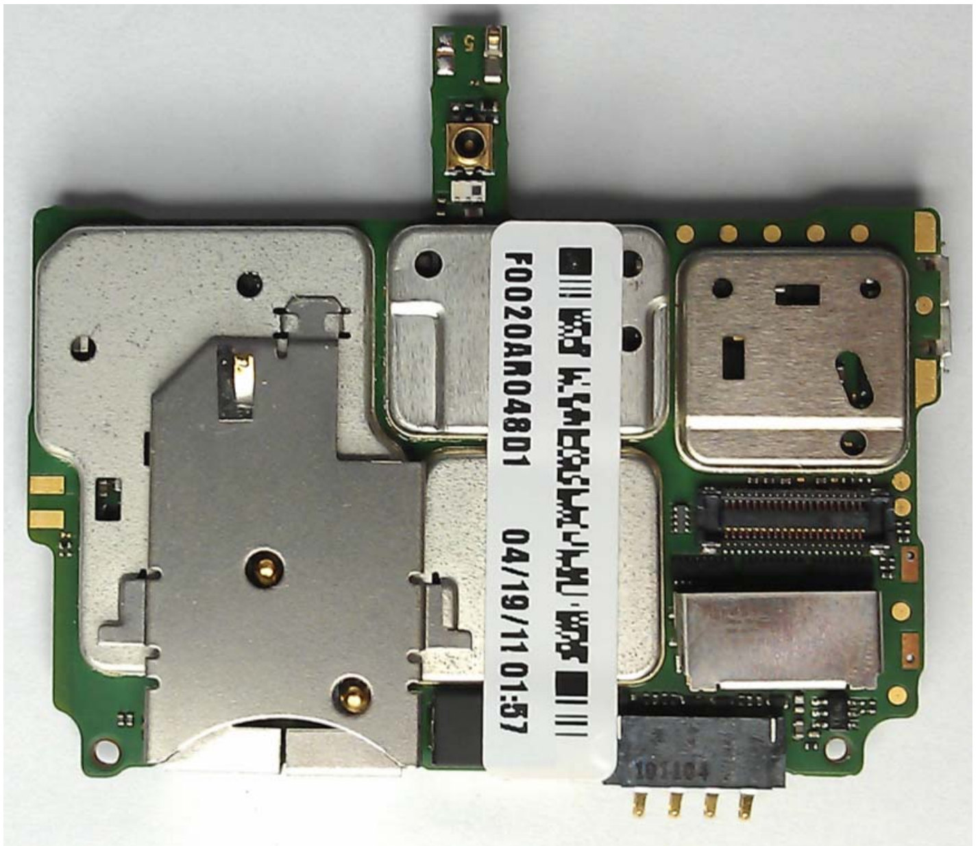
Photograph 9-3: Rear side view of radio product PC Board, Shields in Place.