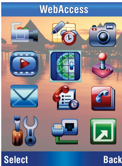
Figure 2 The Motorola V3x display

Note: Screen shot may not reflect actual display size.