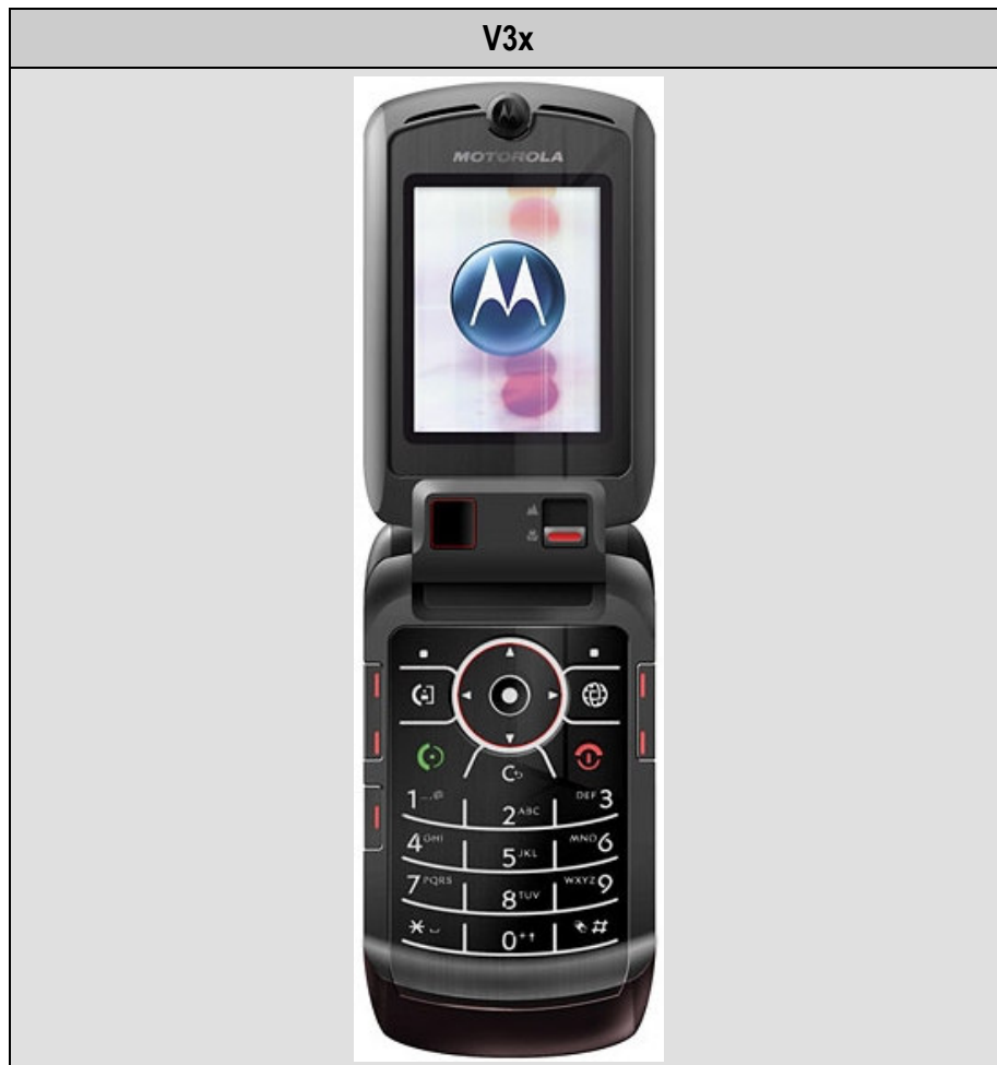
Figure 1 Display characteristics for the Motorola V3x

This chapter describes the display characteristics for the Motorola V3x.