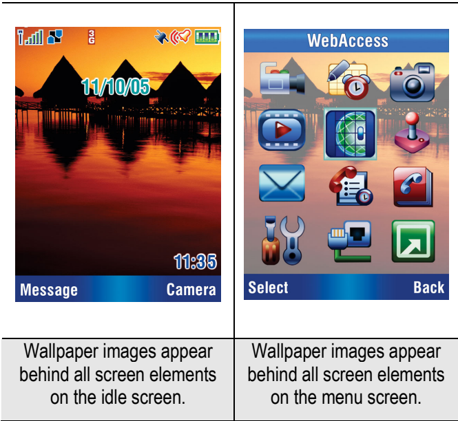
Figure 3 How wallpaper is displayed on the idle screen and main menu screen.

Wallpaper images are displayed on screen as shown in Figure 3.