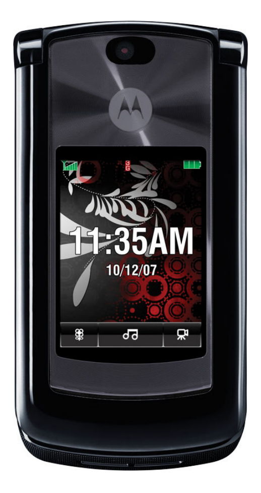
Figure 1: MOTORAZR<sup>2</sup> V9 Handset

This chapter describes the display characteristics for the MOTORAZR<sup>2</sup> V9.